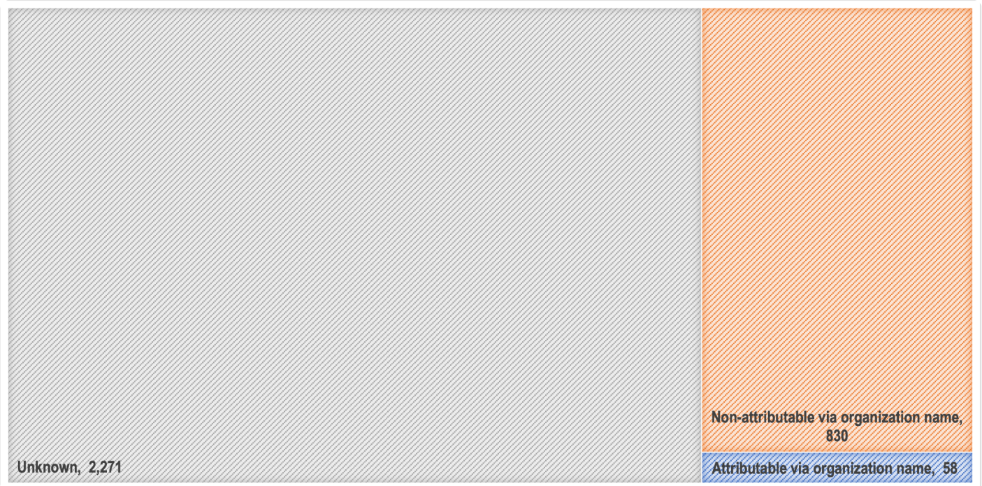
Chart 2: Percentage of the total number of domains containing Crédit Agricole owned but were not owned by the bank

identified registrant organization. The rest didn't share that particular WHOIS record detail or left the field blank.